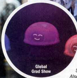
Global Grad Show

cocoa beans to hand-wrapping each bar. Free (advanced online booking required). Nov 13-Dec 13, 10.30am-12.30pm (kids), 3pm-5pm (adults). Mirzam, Alserkal Avenue, Al Quoz, www.mirzam.com (04 563 1426).